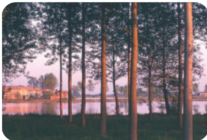
Agricultural park South of Milan

FEDENATUR is ready to take part in these dynamics, in particular in carrying out exchanges between parks and the diffusion of local experiences.