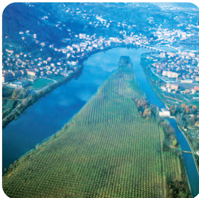
Plantation of poplars in the fluvial park of Po in Turin

For the future, the environment constitutes an important element in the image of cities, susceptible to favouring the implantation of companies or neighbourhoods. Nature is used as an advertising slogan in certain products like mineral waters (Xarxa). Certain collectives use environmental policies to give the city the image of a more natural character and to participate in the very identity of the agglomeration. In this sense, we can note that the slogan of the city of Le Mans is "Le Mans, sacred Nature!", it is directly based on the existence of the Arche de la Nature park. Films, whether artistic or advertising, are sometimes shot in these spaces. No less than 300 advertising films have been shot in the Amsterdam woods!