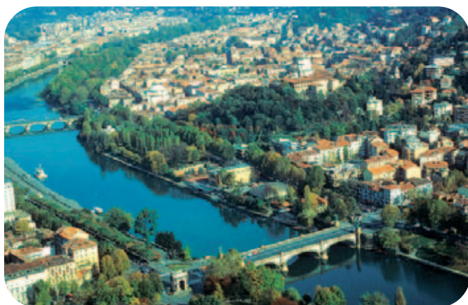
The green areas in the city centre of Turin

On the periphery of the cities, vast spaces (sometimes hundreds of hectares) they may be used for sports and leisure. After some years, the biodiversity is often taken into account, but in a relatively marginal way.