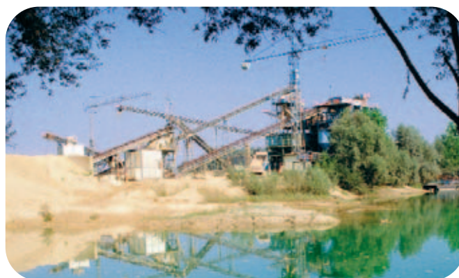
Gravel pits (Turin)