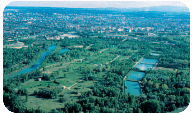
Crépieux-Charmy (Lyon), drinking water catchment's area and natural reserve

Sometimes near the urban centres, very often on the limits of the urban area, there are vast natural and agricultural spaces (some hundreds to dozens of thousands of hectares). Unlike the three earlier types, the land of these "parks" often belongs to private owners. The park is often governed by a specific set of regulations, depending on the national legislation. The actions of the collective in charge of promoting the balanced development of these lands, between the preservation of the biodiversity, evaluation of the spaces for the public and maintaining traditional activities. This type of park corresponds in the most part to sites which are members of Fedenatur.