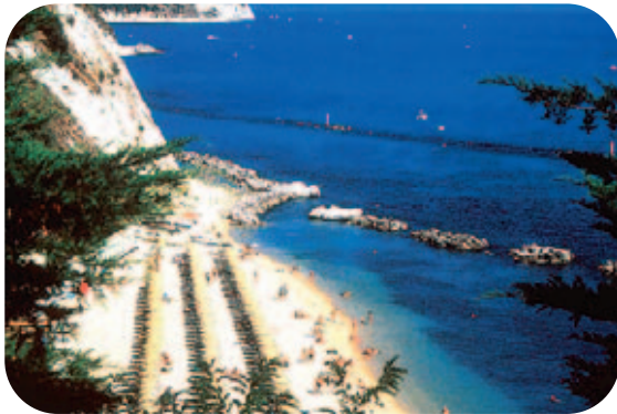
Conero Park near Ancone

The coasts sometimes have vast peri-urban natural spaces, generally preserved because of the rough relief. Flat coastlines are poorer in natural environments, but they often shelter non-urbanised areas: lagoons (Venise, Montpellier), beaches... The most frequent uses are generally tourism and fishing.