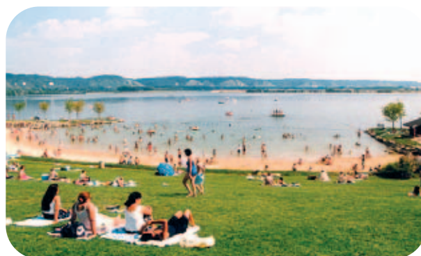
Léry-Poses Park near Rouen