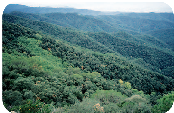
Montnegre Park (Xarxa)

The contact between the city and nature is less clear-cut when the relief is more gentle (hills). Urbanisation and agricultural activities then constitute a mosaic with natural spaces.