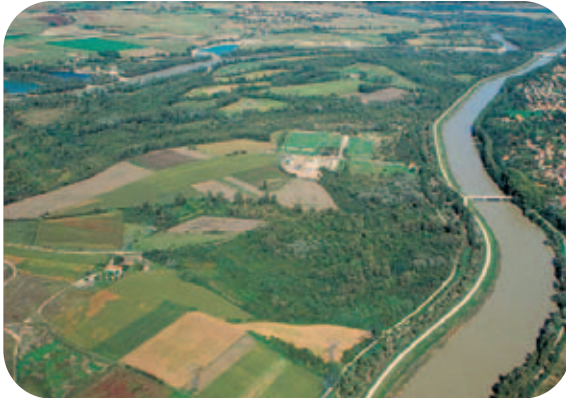
Two views of the Mitibel-Jonage Park