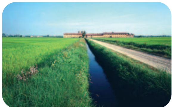
South Milan Park

Natural spaces are little understood within urban areas on plains or plateaux, intensely occupied by the city and agricultural areas. The natural areas subsist within infertile areas, large aristocratic estates, or others have been created recently by certain cities (Deûle Park in Lille, Green Ring of Vitoria).