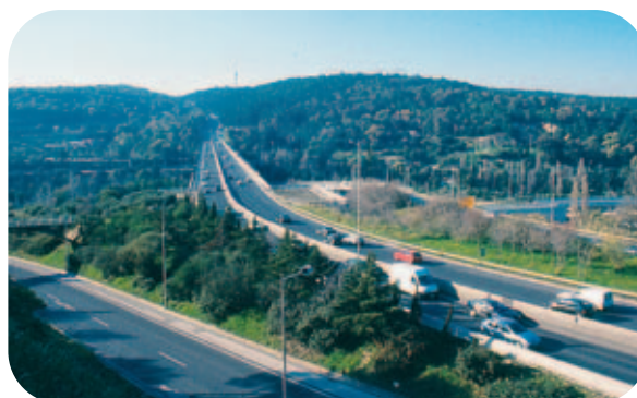
Motorway in the park of Monsanto, Lisbon