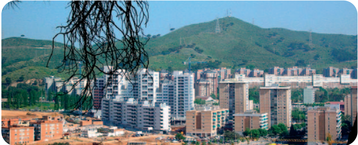
Green areas near cities... but often deteriorated (Collserola, Barcelona)