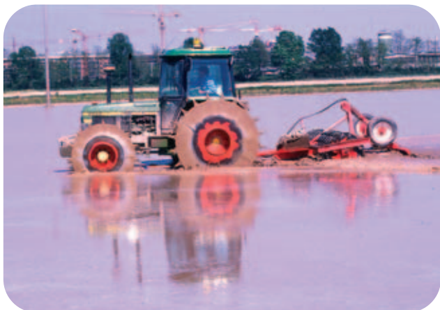
Rice growing in the South of Milan agricultural park

Certain forms of agriculture are linked to urban influence: educational activities, production of fertilizer, experimentation plots (Saint-Quentin-en-Yvelines), preservation of domestic breeds in danger of disappearing (Le Mans).