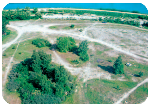
Impact of motorbikes on the land (Mirabel.-Jonage)