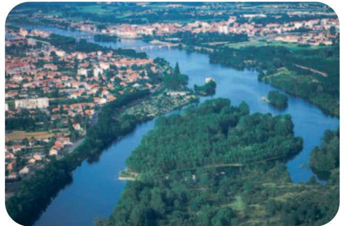
The Loire Valley at Roanne

Flooding and wetlands have constituted an important barrier for urbanisation for a long time. Numerous urban areas have alluvial plains, often occupied by mosaics of natural environments and agricultural areas. The presence of water allows the presence of numerous human activities and natural functions.