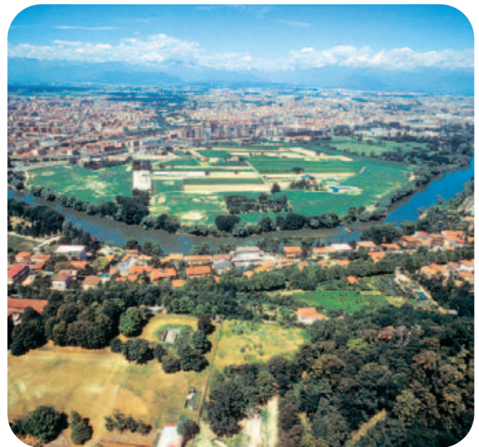
Fluvial Park of Po in Turin

PNS often act as a fundamental facet of the urban identity. In certain cases, nature imposes itself; Grenoble mountain, the sea and Portofino-Genes... In other cases, the local community has modelled the territory in order to give the natural space a strategic role for the city: Arche de la Nature au Mans, the green area of Vitoria.