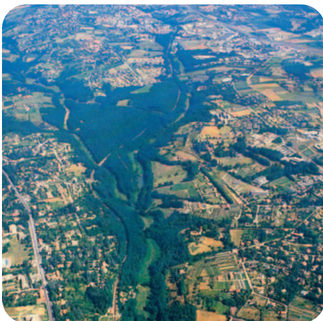
The valleys to the west of Lyon