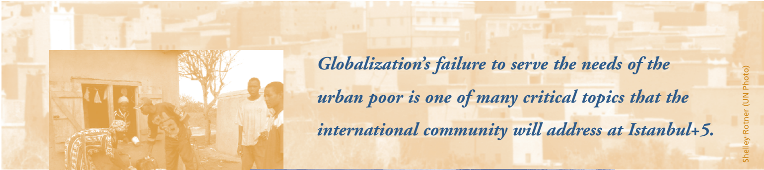
Shelley Rotner (UN Photo)

Globalization's failure to serve the needs of the urban poor is one of many critical topics that the international community will address at Istanbul+5.