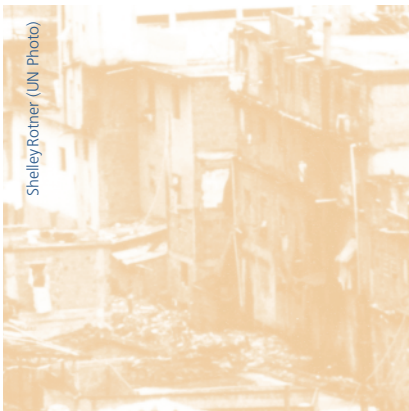
Shelley Rotner (UN Photo)