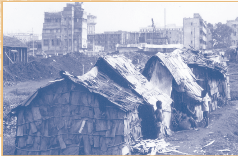
Oddbjorn Monsen (UN Photo)